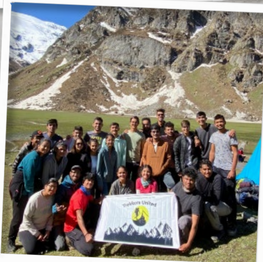
Deo Tibba Base